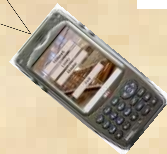
Mobile Terminal (or Cell-Phone....)